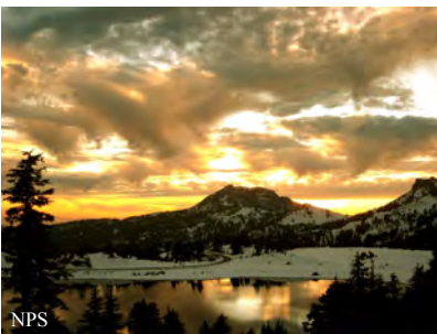
NPS Lake Helen, Lassen Volcanic NP

“Snowshoeing was used primarily for employment and survival until the 1970’s. Today, it is a recreational sport and a great way to enjoy the great outdoors in winter ”