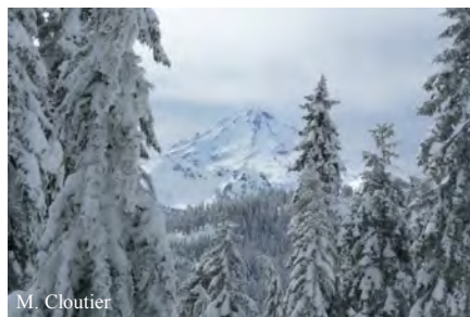
M. Cloutier View from a snowmobile ride at Pilgrim Creek.