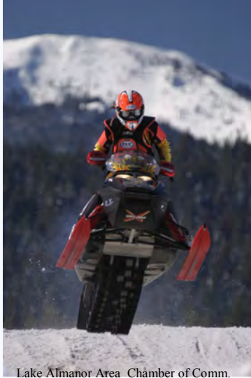
Lake Almanor Area Chamber of Comm.

Spanning the VLSB's two-state byway designation--through aspen groves, conifer forests, and crystal lakes--you'll find gentle trails to adventurous climbs. With a map in hand, a list of hot spots and phone numbers and, of course, a snowmobile, you are ready to go. Beginning on the Crater Lake region in Southern Oregon, you will find some ideal