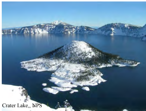
Crater Lake,, NPS

In addition to these activities, special events also make the VLSB region unique this time of year. Three annual sled dog races are scheduled in Chester and Weed, CA and in Chemult, OR. The Winter Wings Festival, occurring on President's Day Weekend in Klamath Falls, is another winter highlight.